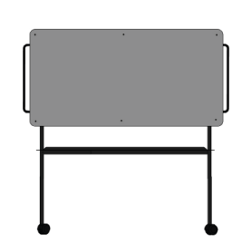
Mezzo W 1600 x H1900 (63" x 74.8")